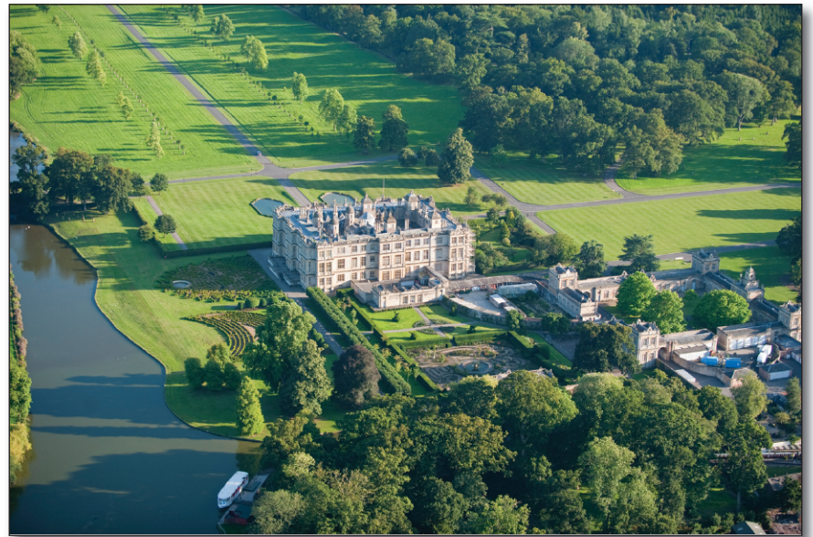
Longleat in its garden setting.